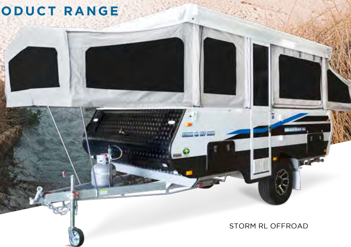
STORM RL OFFROAD