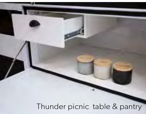
Thunder picnic table & pantry