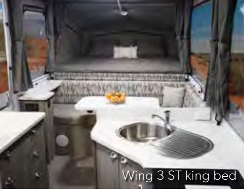
Wing 3 ST king bed