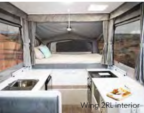
Wing 2RL interior