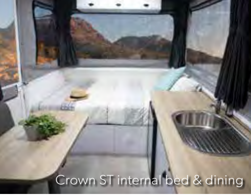
Crown ST internal bed & dining

Our Crown ST model has generous seating for 2 people in the L-shape lounge located near the door, a large kitchen and loads of bench space. It has the same lift up bed and overhead cupboard as the Crown. In addition, the ST model features an internal shower and toilet providing the latest in self-sufficiency and convenience, whilst still taking only minutes to set up. It also comes with 2 x 9kg gas bottles and 2 x 59L water tanks along with a gas hot water service as standard to provide plenty of hot water to the shower and sink.