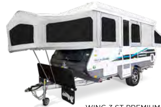
WING 3 ST PREMIUM