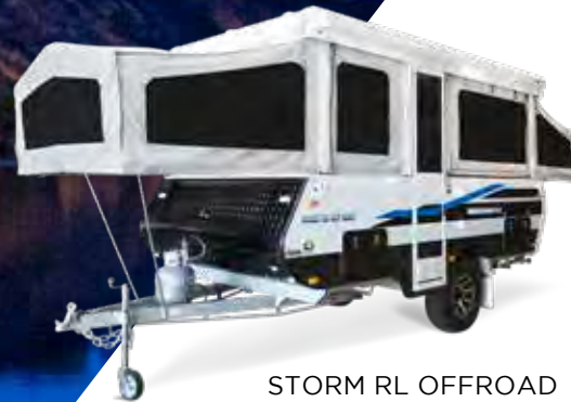
STORM RL OFFROAD

Welcome to the Goldstream RV Camper Trailer range, your world of adventure starts here.