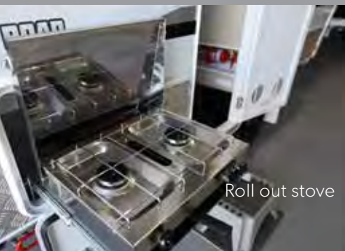
Roll out stove