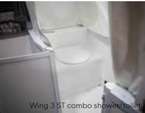
Wing 3 ST combo shower/toilet