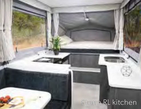
Storm RL kitchen

The club lounge seating areas are big enough to seat a family comfortably and are the perfect spot for family meals or a board game while the expansive bench and cupboard space makes the Storm models a great family choice. On the outside, the Storm Camper models have roll-out stoves as standard great for a quick meal stop along the way, a large front storage boot and a side opening access door ideal for storing additional items.