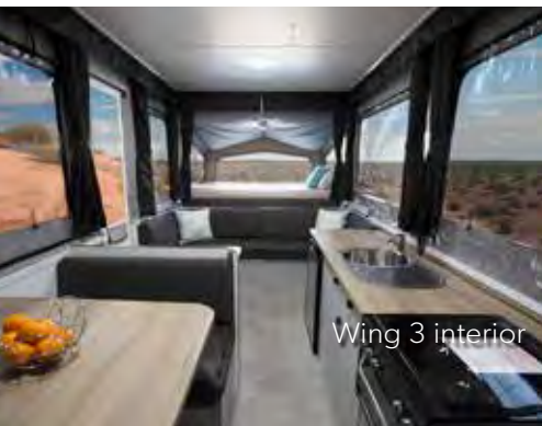
Wing 3 interior