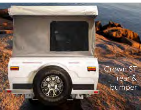
Crown ST rear & bumper