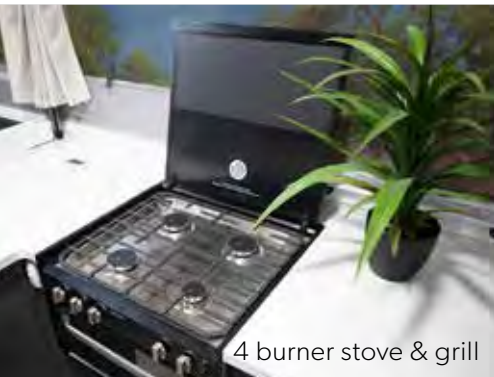
4 burner stove & grill