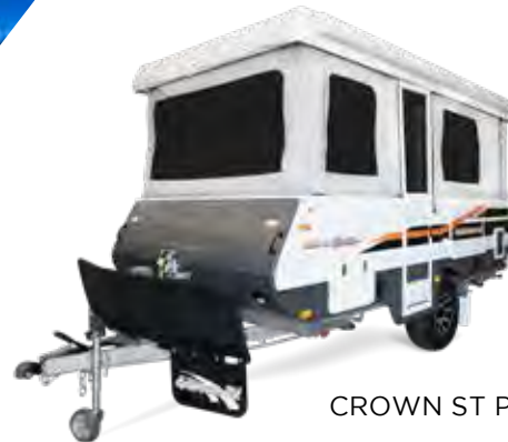
CROWN ST PREMIUM