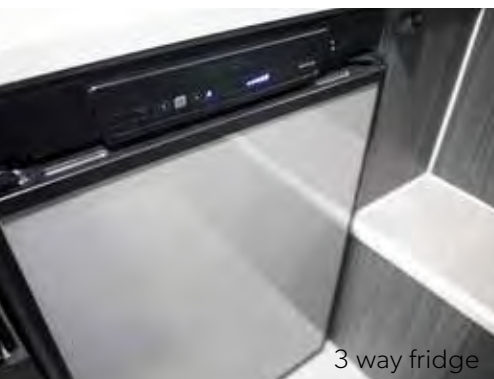
3 way fridge