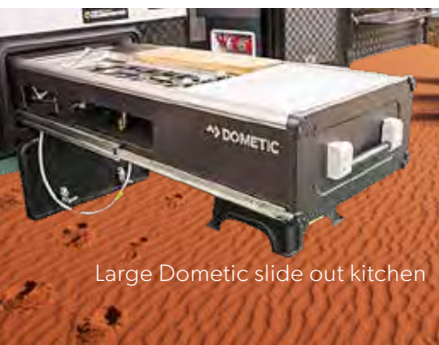
Large Dometic slide out kitchen