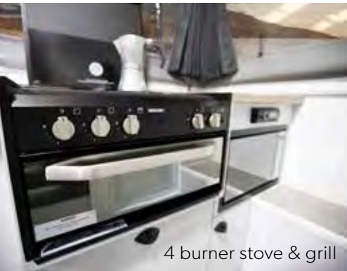
4 burner stove & grill