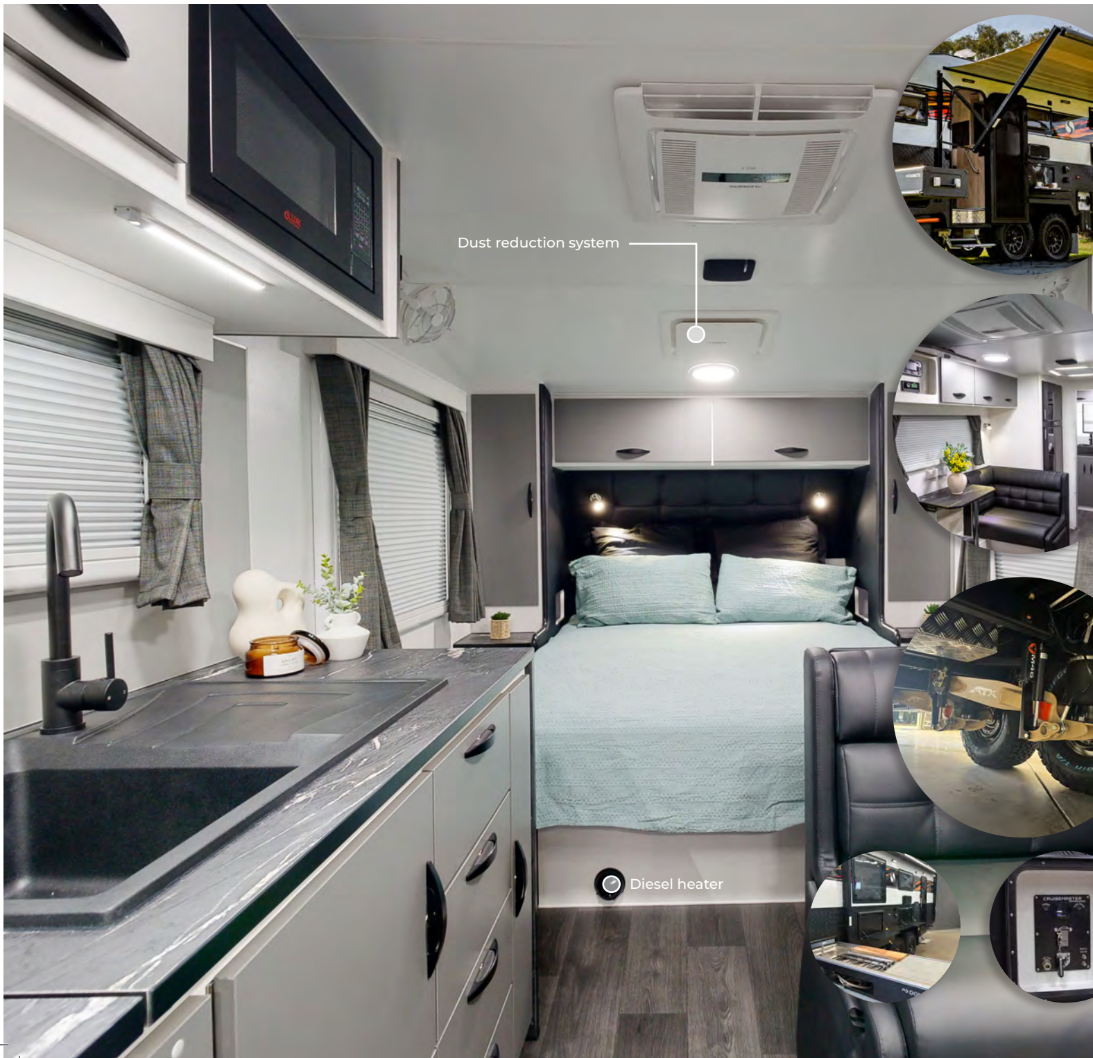
Dust reduction system